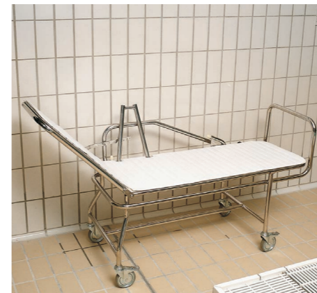
The ArjoHuntleigh Pool Lift stretcher has a comfortable mattress. Velcro makes it easy to remove for cleaning etc. The ArjoHuntleigh Pool Lift stretcher trolley is made of stainless steel.